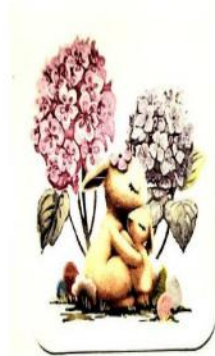
A Mom's Day Treat for "Somebunny" Sweet!

Any other "like new" items are also much appreciated, inc. cosmetic bags