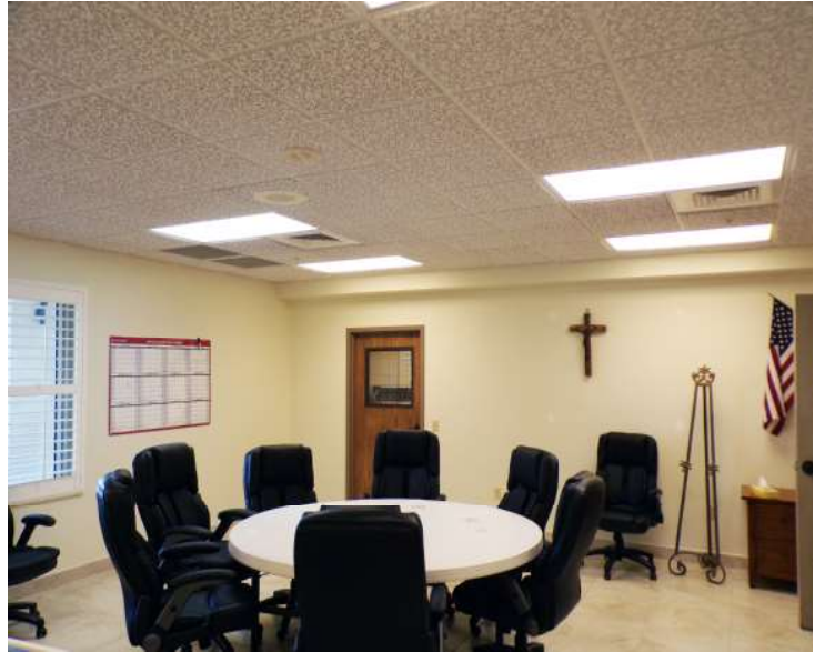
Blessed Frederic Ozanam Room

For 2018-2019, the Buildings and Properties Committee is prioritizing the projects that need to be completed. So far, an air conditioning unit has been replaced at Prince of Peace and the lighting at Our Lady of Lourdes Church continues to be upgraded.