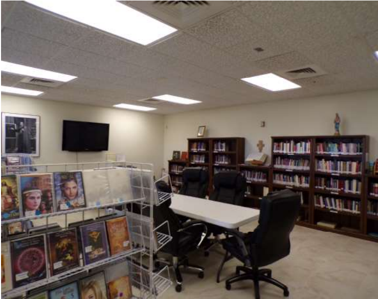
Venerable Blessed Fulton Sheen Library